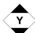
Limit Quantities by Air