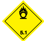
Class 5.1 HAZARD Oxidizing Substances

ADR , Annex A General provisions and provisions concerning dangerous substances and articles; Classification; Class Specific Provisions