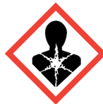
GHS08 Health Hazard