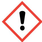
GHS07 Harmful Irritating